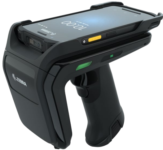
RFD40 RFID Sled See table for part numbers