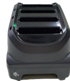
4-slot Battery Charger