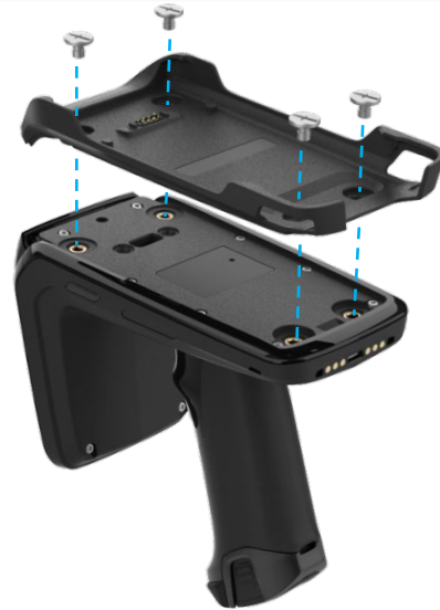
TC21/26 Sled Adaptor ADP-RFD40-TC2X-1E