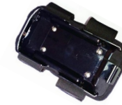
Wearable Arm Mount