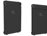
Batteries (3300 mAh, 5260 mAh)